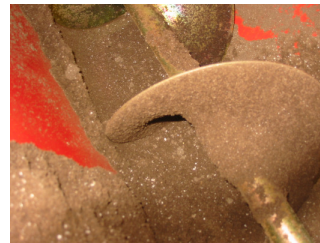
Soil Return Auger