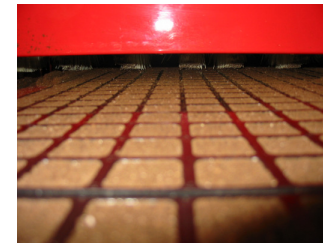
Spiral Finishing Brush