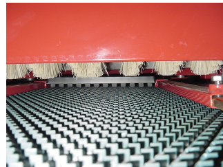
High Grip Conveyor